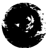
[Signature] CHARLITO MARTIN R. MENDOZA Commissioner of Internal Revenue

This Order shall take effect immediately upon issuance.